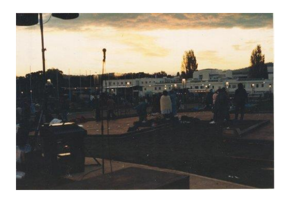
A New Day Dawns

Looking towards Old Parliament House from the Western Prayer Podium, at the conclusion of ten hours of continual prayer through the night for the Nation.