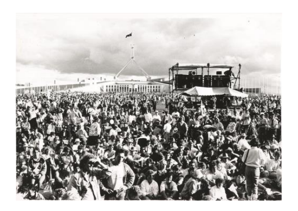
The National Gathering

At the base of the flag support, second from right, is the highest room in the building, set aside for prayer, known as the "upper room".